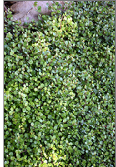
Creeping Wire Vine