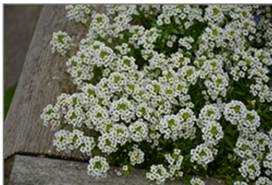
Snow Princess Alyssum flowers

Snow Princess Alyssum is recommended for the following landscape applications;