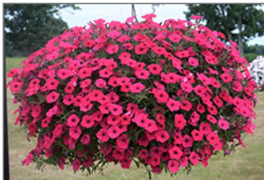
Supertunia Vista Fuchsia Petunia in bloom