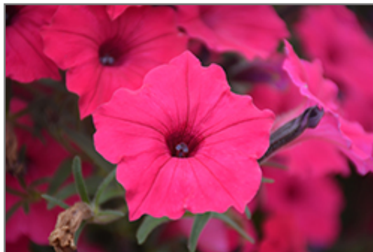
Supertunia Vista Fuchsia Petunia flowers