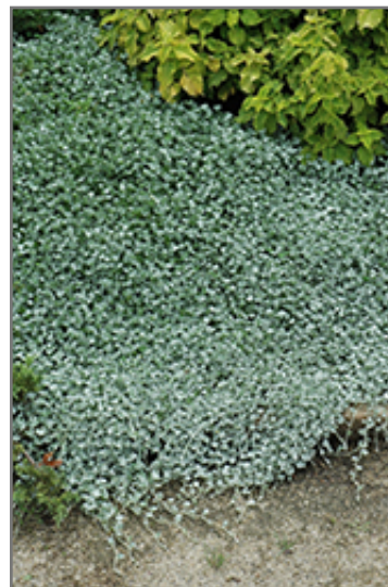
Silver Falls Dichondra