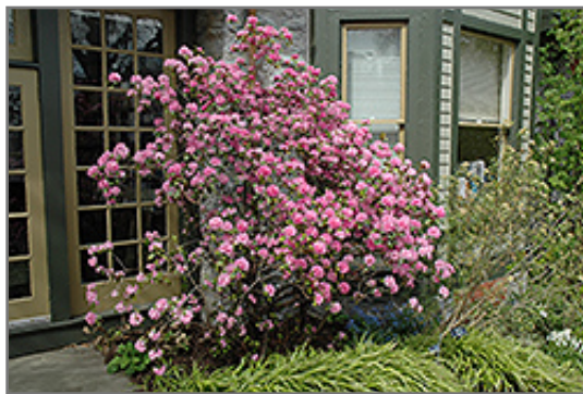
Olga Mezitt Rhododendron in bloom