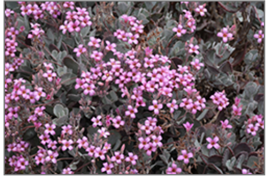
Flower Dust Plant flowers

Flower Dust Plant is recommended for the following landscape applications;