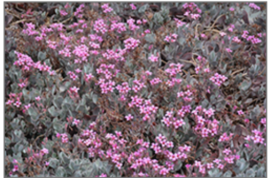
Flower Dust Plant in bloom