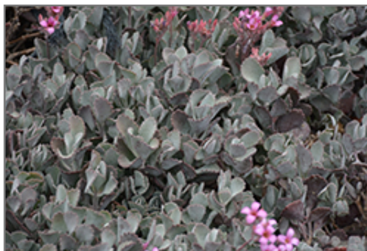
Flower Dust Plant foliage

Flower Dust Plant will grow to be about 8 inches tall at maturity extending to 12 inches tall with the flowers, with a spread of 24 inches. When grown in masses or used as a bedding plant, individual plants should be spaced approximately 18 inches apart. Its foliage tends to remain low and dense right to the ground. Although it's not a true annual, this plant can be expected to behave as an annual in our climate if left outdoors over the winter, usually needing replacement the following year. As such, gardeners should take into consideration that it will perform differently than it would in its native habitat.