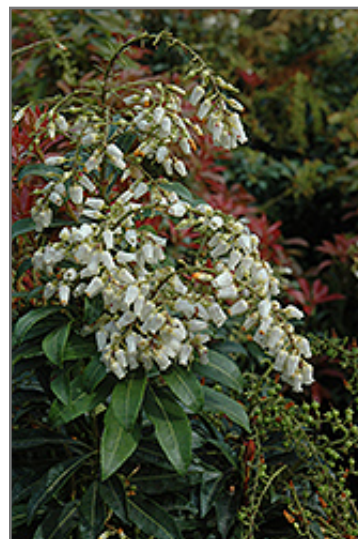
Mountain Fire Japanese Pieris flowers