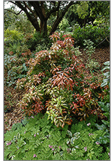
Mountain Fire Japanese Pieris

This shrub does best in full sun to partial shade. It requires an evenly moist well-drained soil for optimal growth, but will die in standing water. It is very fussy about its soil conditions and must have rich, acidic soils to ensure success, and is subject to chlorosis (yellowing) of the foliage in alkaline soils. It is somewhat tolerant of urban pollution, and will benefit from being planted in a relatively sheltered location. Consider applying a thick mulch around the root zone in winter to protect it in exposed locations or colder microclimates. This is a selected variety of a species not originally from North America, and parts of it are known to be toxic to humans and animals, so care should be exercised in planting it around children and pets.